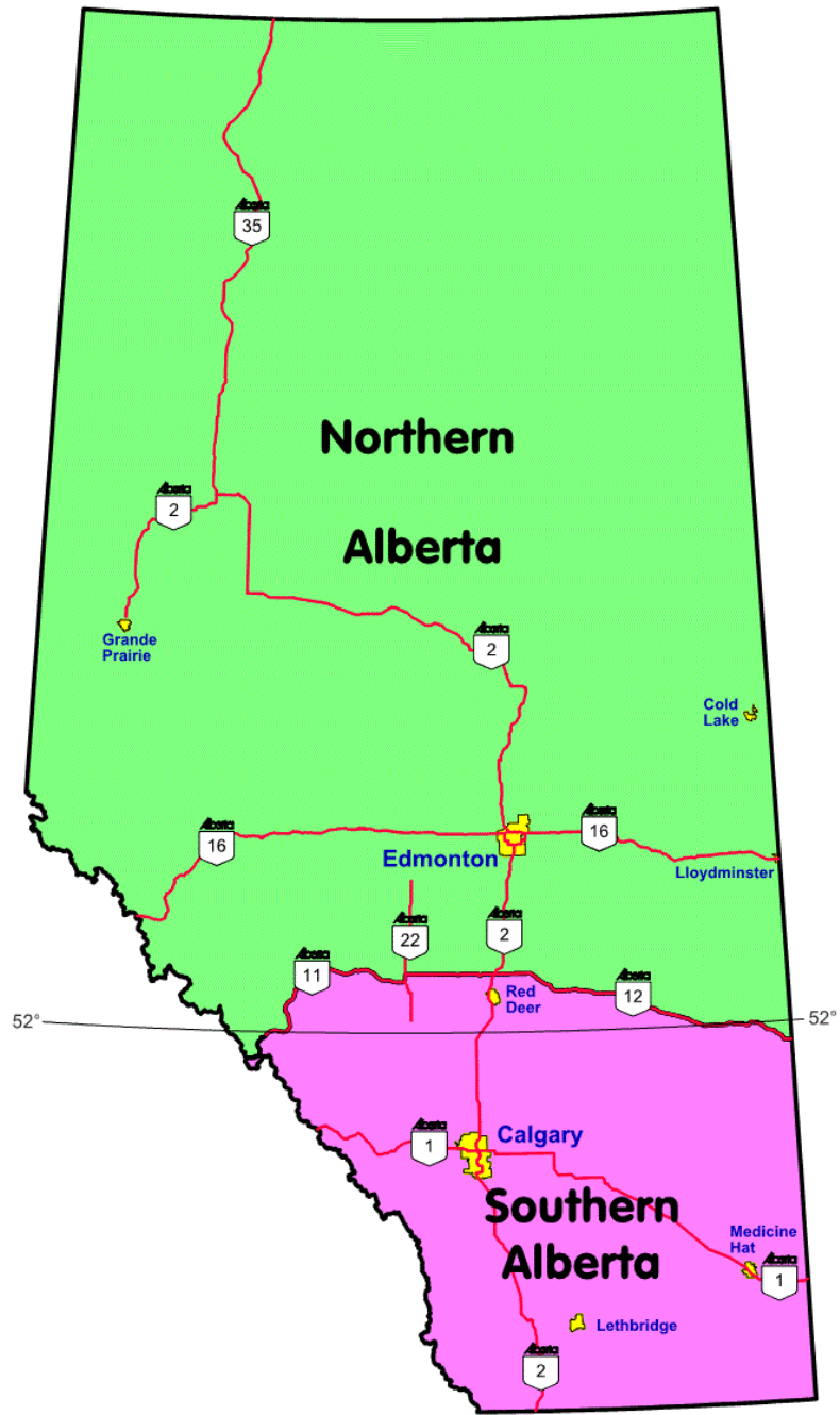
Schedule D - Districts Map 2